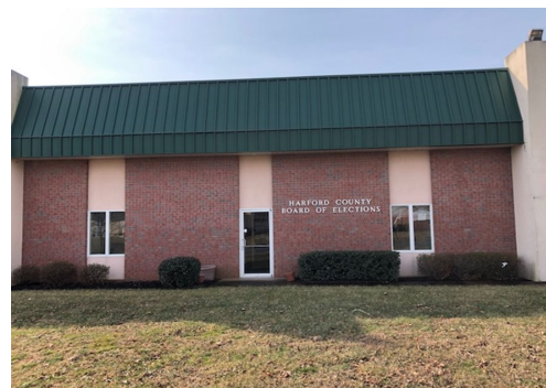
Harford County Board of Elections