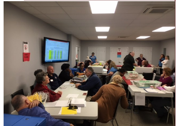
The count goes on