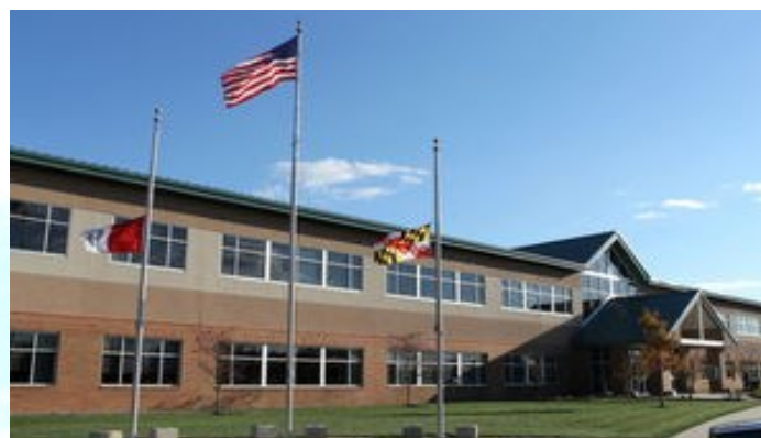
Cecil County's main office in Elkton.

As an office, we proudly embrace our role in the conservancy of convenience, uniformity, accessibility, impartiality, and precision surrounding the election processes; "Do what's right, work as a team and get results." With an estimated population of 102,603 and 64,233 active voters, some may say that we are a pretty small county, but we all know that every county has their own set of obstacles during an election. During this past election, we experienced a record breaking number of voters, causing early voting lines to be extremely long. Despite the large numbers of people, we received great feedback from our county officials and the media about how we managed lines and kept the wait times under 20 minutes. We were very fortunate to have a wonderful team of techs and office staff - having all hands on deck to make sure that