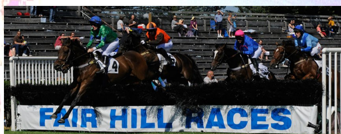
The Fair Hill Races in Elkton, MD.